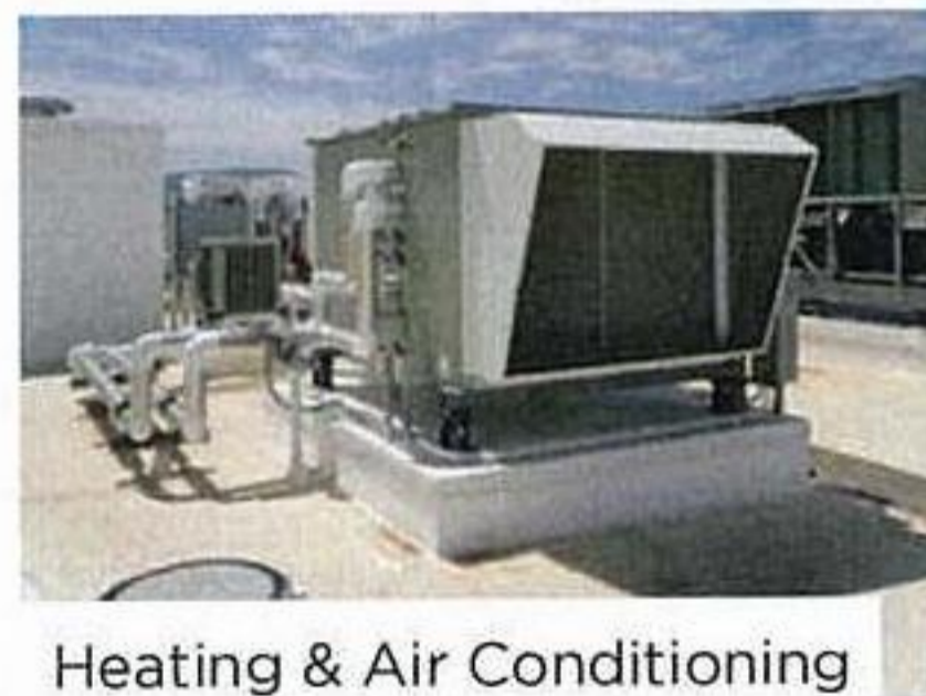
Heating & Air Conditioning